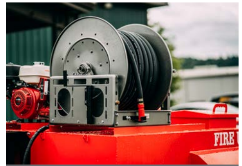
Hannay's 1-1/2 inch power or manual rewind hose reels are mounted to trailers for a wide variety of water applications.