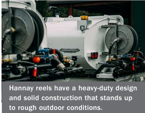
Hannay reels have a heavy-duty design and solid construction that stands up to rough outdoor conditions.