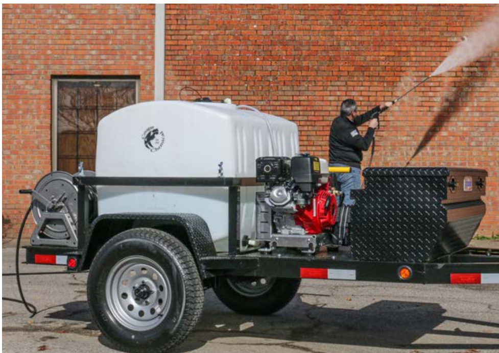
Hannay Reels 1500 Series hose reels are installed on this Cougar Catamount 200 hot water pressure washer trailer package.