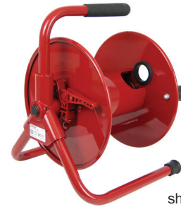
Model C16-10-11 shown with optional red finish