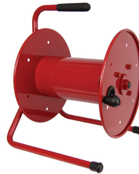
Model C20-14-16 shown with optional red finish