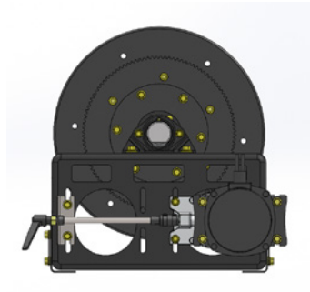
Straight on Side View: Inline Gearbox configured on right side of reel.