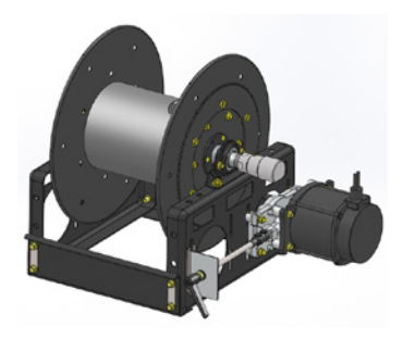
Side Front View: Inline Gearbox configured on right side of reel.