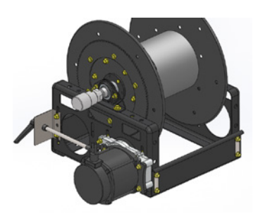
Rear View: Inline Gearbox configured on right side of reel.