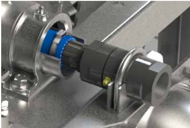
Close-up of CPVC swivel, clamp and mounting bracket.