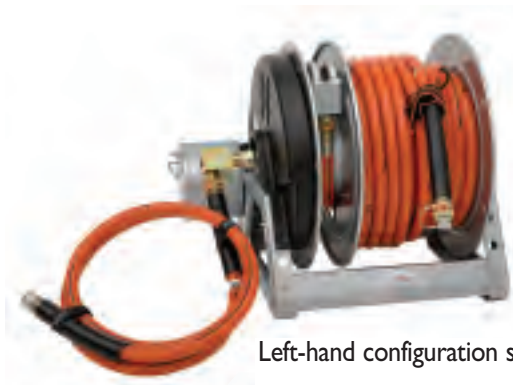
Left-hand configuration shown