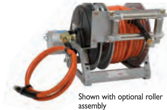
Shown with optional roller assembly